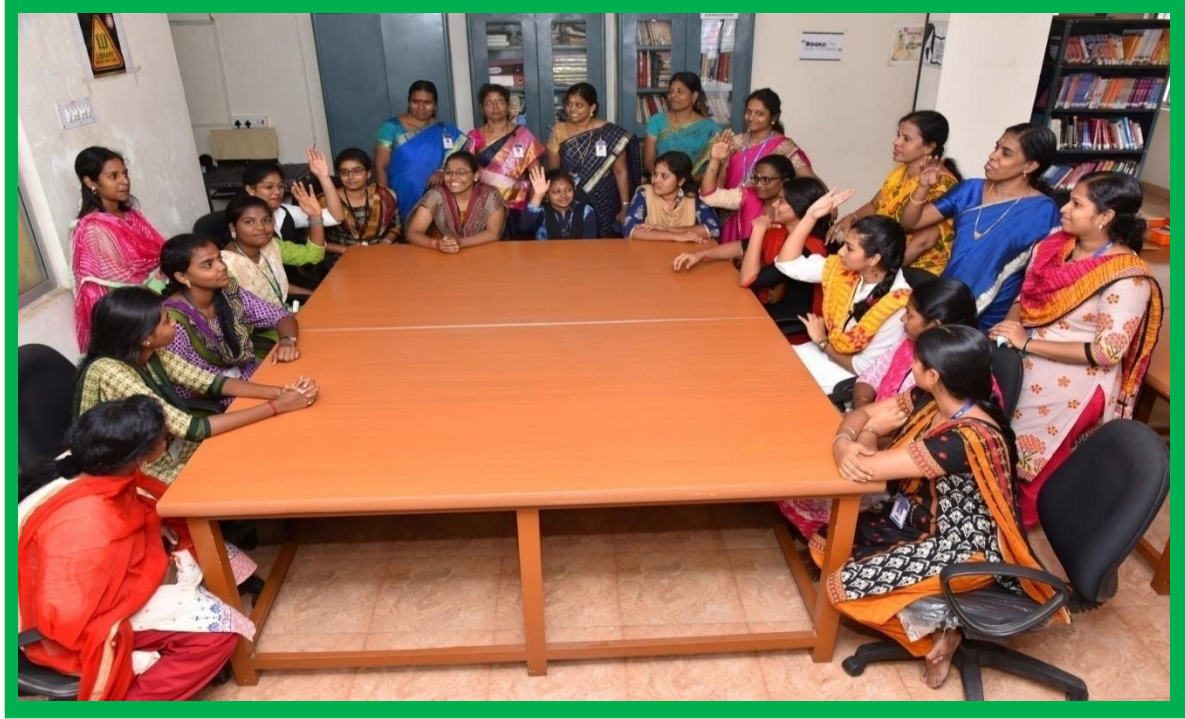
SHORTLISTED PARTICIPANTS FOR THE SECOND PHASE