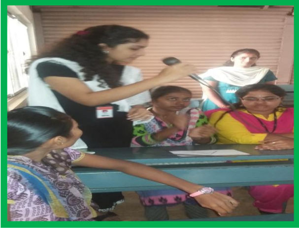
PHASE 3 - FINAL ROUND