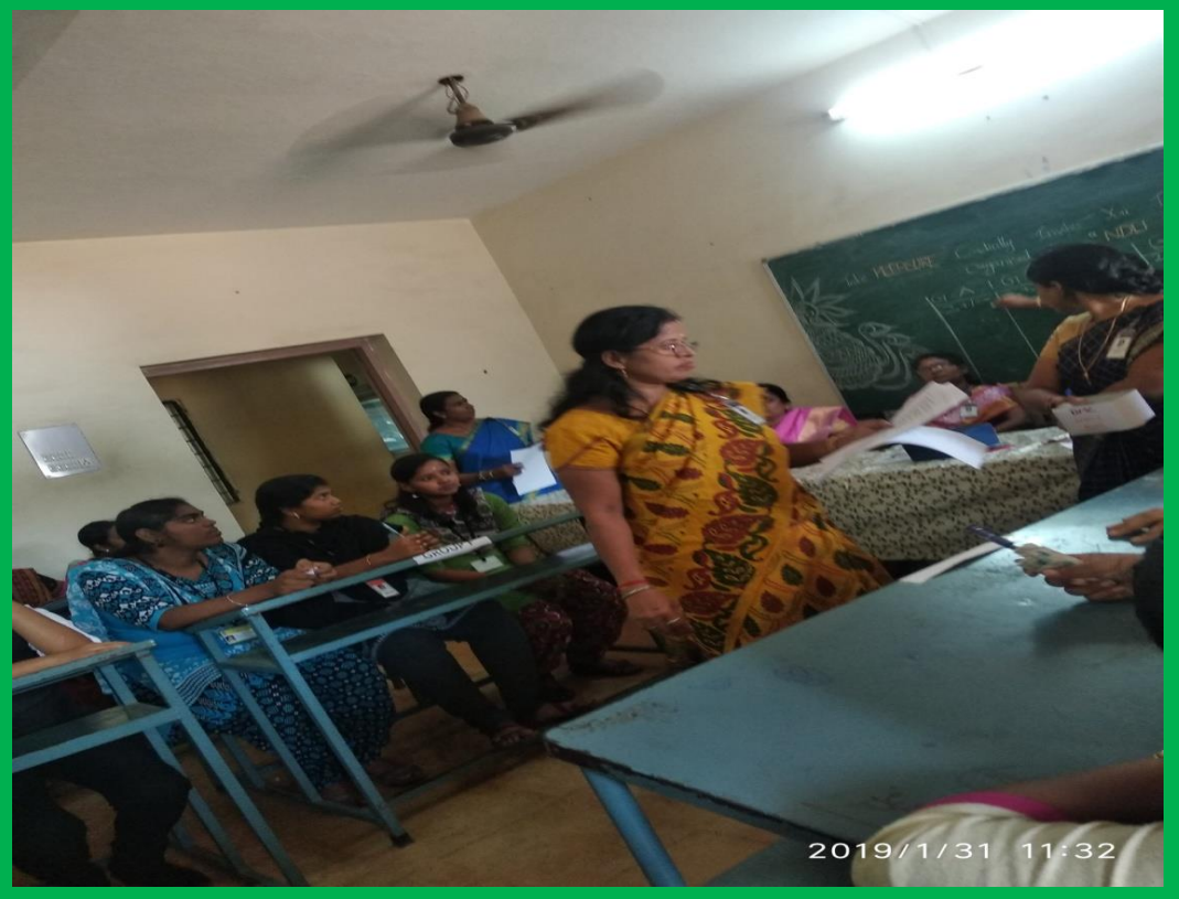
PHASE 2- ORAL QUIZ