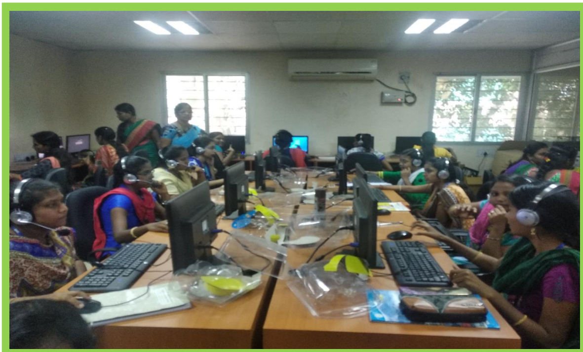
STUDENTS ACCESSING NDLI